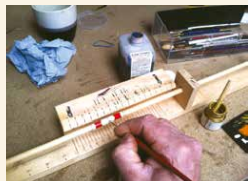
Cresting the arrow shaft