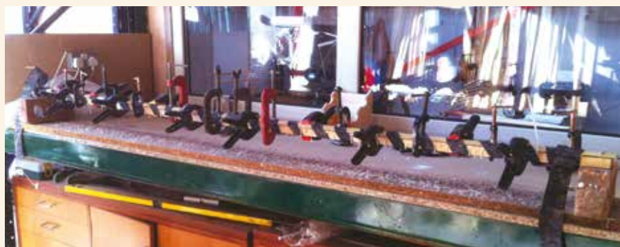
A laminated stave being glued up