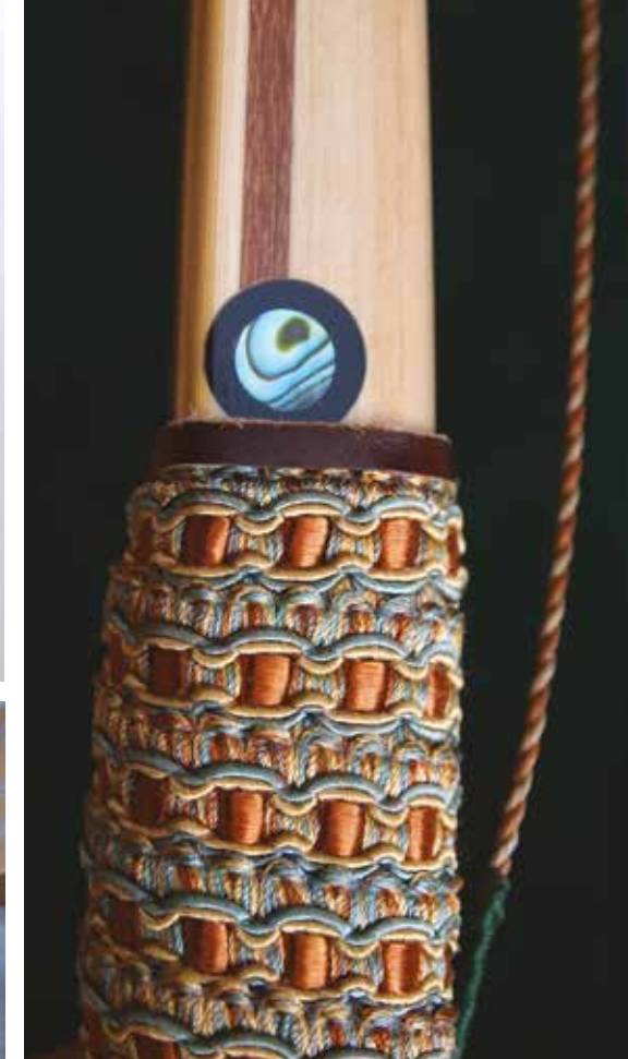
Detail of Marc's signature 'arrow pass'

and bamboo (although this is a grass!) All woods used in modern longbow making are ethically sourced in accordance with CITES and EU Timber Regulations. A typical example of a starter bow would have a maple 'back', a lemonwood 'belly' and a tapered purpleheart core.