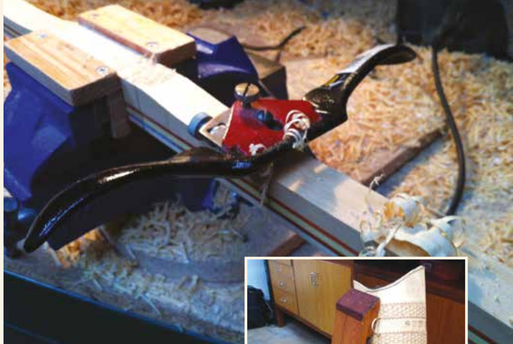
Shaping the bow handle

One small and attractive detail that is usually added to the longbow is an inlaid piece of abalone or mother of pearl placed just above the wrapped grip. This is called the 'arrow pass' and is there to prevent the arrows striking and wearing the bow woods. The next job is to fashion the two horn nock blanks which have recesses in them to fit