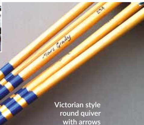
Victorian style round quiver with arrows