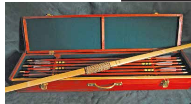
A beautiful matched set of bow and arrows

The Guild like any overseeing body worth the name, requires its newly accomplished members to prove to the Guild that they have met the truly exacting standards required to make longbows, arrows and strings by presenting 'Master Pieces' at the end of a three-year apprenticeship. The Craft Guild offers the only official qualification in longbow making and associated crafts in the UK, possibly even, the world. The Worshipful Companies of Bowyers and Fletchers respectively, who are no longer active craft guilds, nevertheless give their support and oversight to the Craft Guild's activities. Anyone contemplating taking up target archery should take care to not only have proper instruction but also to purchase