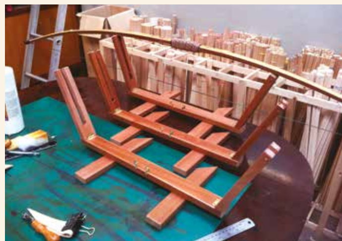
Folding bow stands in sapele