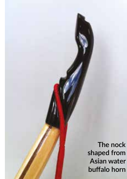
The nock shaped from Asian water buffalo horn