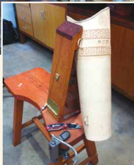
A 'stitching pony' used for holding leather while hand stitching

on the tips of the stave. They are bonded in place with two-part epoxy resin and then shaped in-situ. They have a basic consistency in style, with a slot made with a round file for the string to sit in. The nocks are polished on a buffing wheel and after that a finish can be applied to the stave. The remaining job is adding the textured decorative grip in the centre of the stave. In total it takes about five to six weeks to make a longbow and about a week to make the arrows in a batch of a dozen.