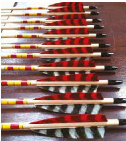
A finely matched set of 'barred' fletchings made from turkey feathers

Gone from regular archery in this country are the splayed arrowheads that are impossible to remove from human or animal flesh or diamond shaped tips to penetrate chainmail or armour. Instead a simple brass bullet shaped point is all that is required to penetrate 4 inches of the standard straw or foam competition target from a hundred yards. These will be from 30 grains to 125 grains in weight (15.4 grains to a gram). Notwithstanding the focus upon competition archery it is important to remember that these are still extremely dangerous weapons capable of inflicting serious or lethal injury.