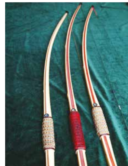
Three bespoke target long bows

This is the beginning of the longbow's construction and is the basic lump of wood or woods upon which the bow is marked out and from which the bow is shaped. This can either be of a single piece of wood such as yew or ash, leading to the construction of a 'self bow' or a combination of woods in a lamination, taking advantage of old fashioned Cascamite or modern synthetic glues for build strength. A misconception is that a longbow is always formed from one long section of timber which is not always the case. Where suitable pieces of woods are found to be too short they can be skilfully joined to make up the stave with tightly worked W or Z shaped fishtail joints. Before the development of suitable adhesives, it was essential that all military longbows were made from yew ( Taxus Baccata ). This is because the soft white sapwood, naturally bonded to the dark heartwood, is excellent in expansion and preventing the fibres running along the back of the bow from breaking. Not all wood is suitable to be called a 'bow wood' and intense debate continues about the engineering properties that make some woods better than others, at not only withstanding the stresses involved but which are also capable of returning efficiently all the energy placed in them when the bow is bent. Examples of woods that have stood the test of time in bow making are degame or lemonwood, greenheart, purpleheart, hickory, maple, and more recently ipe