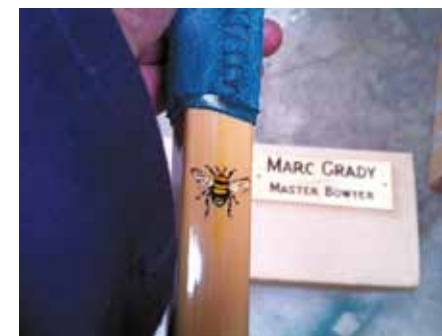
Bespoke detailing for a client