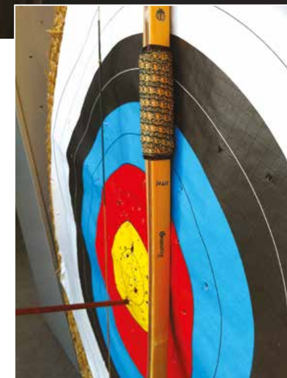
A bespoke bow with the word 'Gramercy' - Thank you resting against a target