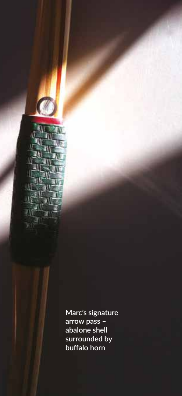
Marc's signature arrow pass - abalone shell surrounded by buffalo horn

bow and expansion of fibre on the outside, as the string is drawn, places the materials under extraordinary stress. Furthermore, as the limbs come forward upon release of the string, but are then snapped still by the taught string, this sends enormous shock waves through the woods; so the way the timber is chosen, the bow constructed and shaped is critical if it is to stay the course. Marc creates what are termed 'Victorian style target bows', made for fast, flat-trajectory shooting of tournament arrows and wherever possible using traditional methods. The bows are bespoke to the customer requirements and made from the finest hardwoods, beautifully finished and 'dressed' referring to the decorative fittings and finishings which make each one unique. Marc also offers bow kits, arrows, leatherwork, archery components and a repair service. ➤